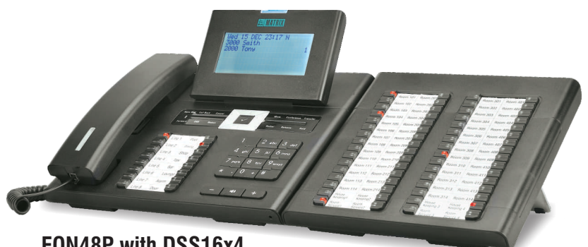
EON48P with DSS16x4