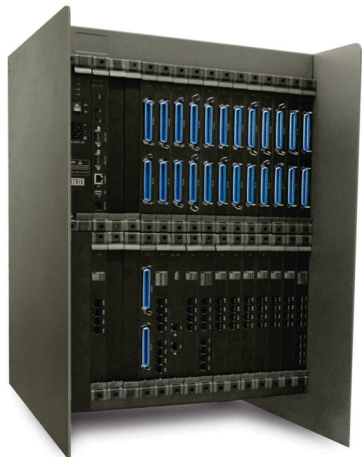
MATRIX ETERNITY LE UP TO 1500 PORTS

Matrix along with its Mumbai based channel partner – Quaitel Automations offered Matrix ETERNITY LE IP-PBX as a solution. ETERNITY LE is a compact, single rack solution supporting up to 1500 ports and offers cutting-edge functionalities eliminating the need of large power stations and multiple cabinets. The solution offered by Matrix also included Matrix Digital Phones (EON48S), ISDN PRI and VoIP connectivity.